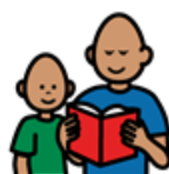
Listen to a story