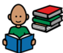
Read a book