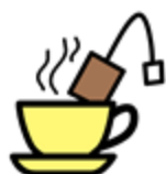
Tea and chat