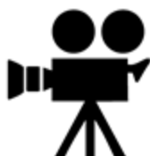
Watch a film