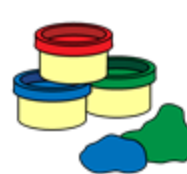
Make play doh