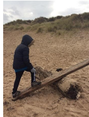
Using a see-saw made from natural materials