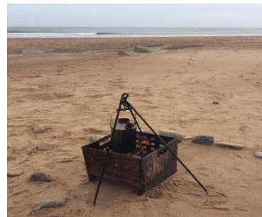
Cooking on the Fire pit